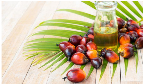
Palm oil and palm oil fruit.

Palm oil is something which is found in many everyday products from biscuits to butter and even pet food! Sadly, palm oil which is grown in a bad or unsustainable way can destroy the homes of many animals including orangutans. Not good at all! At Tilgate Nature Centre we encourage our visitors to purchase sustainable palm oil products instead. These aren't too hard to find and even include Sainsburys, Marks and Spencer and Aldi own brand products. Some people say to avoid palm oil altogether, the problem with this is that it is actually incredibly efficient and takes up less space to grow than many other types of oils, also many livelihoods are supported by the production of the palm oil. Therefore, we believe that it's best to purchase products that, perhaps, still contain palm oil, but only if grown in a considered, thoughtful and sustainable way, supporting the environment and looking after the homes of animals.