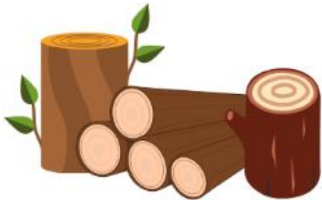
Logs and sticks: Good for beetles and woodlice