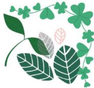
Fresh leaves: Good for ladybirds and lacewings