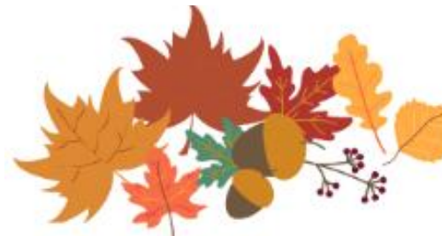
Dry leaves: Good for beetles and spiders and millipedes