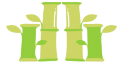
Bamboo: Good for bees