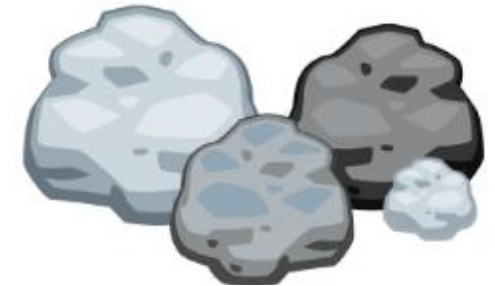
Rocks: Good for woodlice, slugs and centipedes