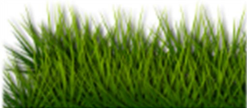
Grass: Good for ants, grasshoppers and crickets